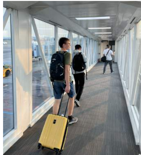
((b)) Nul-Kryds Student Boarding towards Busan

At 8:00 PM local time, we reached our hotel. Most of us headed out to enjoy a local Korean BBQ, the first of many memorable encounters with local culture and cuisine.