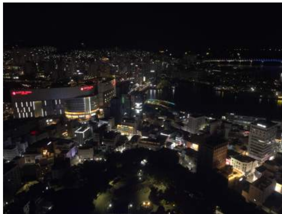
Figure 2: Night view of southern Busan from the Diamond Tower

To end of an eventful day we went to the very top of the Diamond Tower (Busan Tower), a needle like structure that soars 120 meters above its base which is already located above the surrounding city. Here we could enjoy views the of city at night.