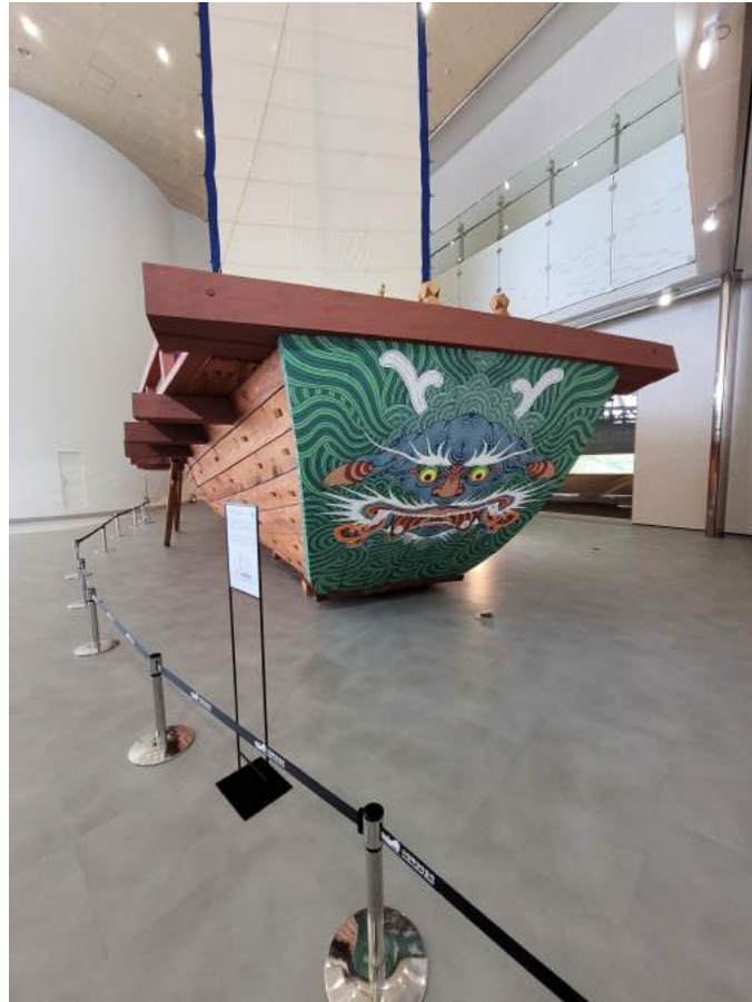
Figure 6: Ancient Korean Ship for trade.

After a week full of impressions and experiences the group were getting ready to head towards Denmark and went with the bus from the museum to the airport.