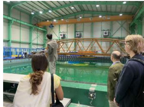
((b)) Square wave basin