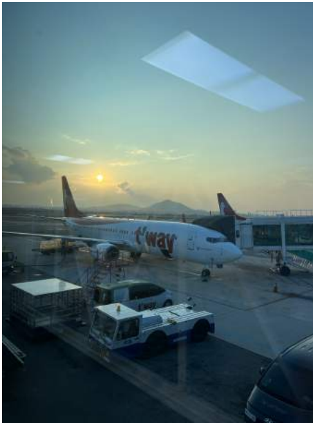
((a)) Seoul Scenery

We landed in South Korea, tired but excited, and proceeded to Busan after making necessary arrangements. (Include a photo here, capturing the sense of anticipation.)