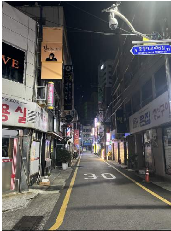
Figure 1: Strolling by shortly after arriving

Our journey had just begun, yet we were already creating memories of beauty, culture, and shared experiences between us and the south Korean people. Next we would have to explore Busan city a little and then insightful days would be ahead of us on the different shipyards and companies.