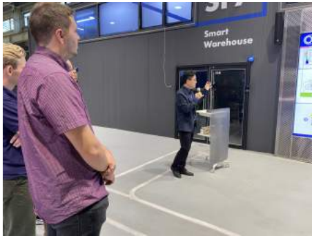
((a)) Smart Factory facility

Monday morning began with a traditional breakfast at the hotel. Subsequently, the group drove by bus in the westerly direction of Busan, with the destination being Changwon National University. Upon arriving at the university, the Danish delegation received a warm welcome and was escorted into a classroom. There, two professors from the university's maritime institute provided valuable insights into their current research, detailed the offerings of the university, and showcased its impressive facilities. Following the brief presentation, the professors led the group on a tour of the maritime department at the university. The first stop was a building equipped with a square wave basin designed for model-scale testings of all kinds of vessels. Some students demonstrated how they work with the wave basin and how the waves could be generated according to specific dimensions and directions. Subsequently, the group were brought to a spacious building, named the "Smart Factory", containing a multitude of rooms housing robotic equipment for e.g. welding, milling, and the production of microchips, among other technological applications. Many parallels could be made with the student workshop at Skylab. The visit ended off with lunch and bridge building together with some of the maritime students from the university.