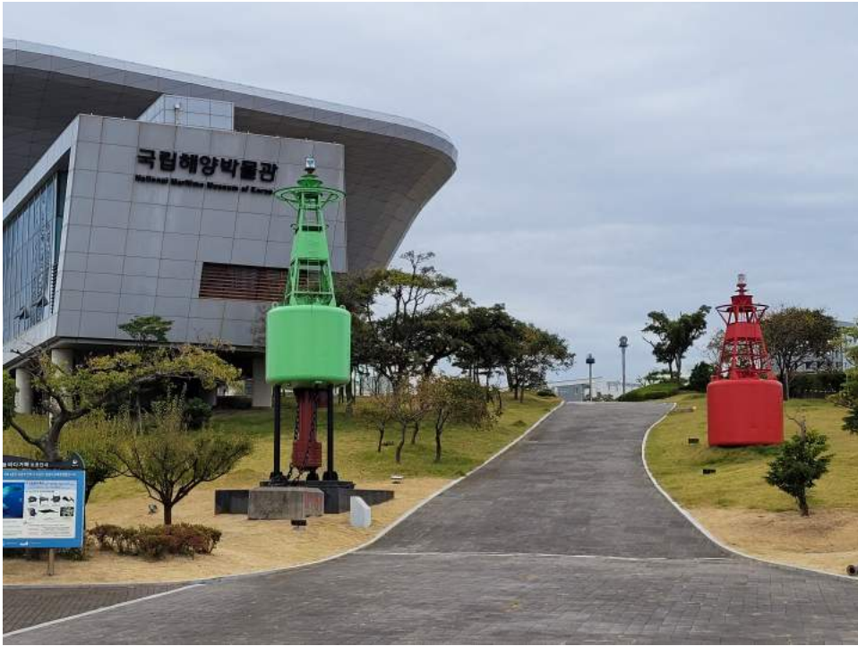
Figure 5: Maritime Museum in Busan

Magnus Strube Østergaard, Mads Holmgaard Jensen