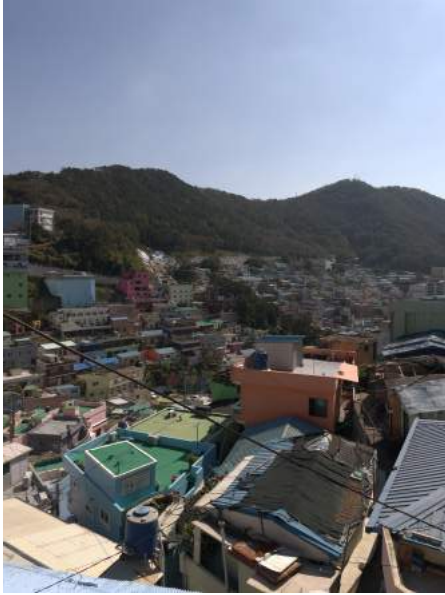
((a)) View over Gamcheon

After breakfast the team for who had planned a program the day took us to Gamcheon Culture Village, which we walked to from the hotel, a nice and steep walk. In Gamcheon we could enjoy great views and exciting street food.