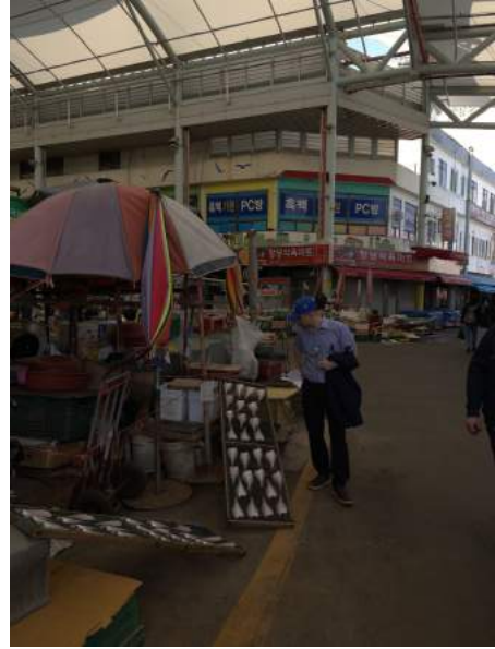
((b)) Fish vendor at Jagalchi fish market

From Gamcheon Culture Village we went to see the Jagalchi fish market where we saw the vast amount of different vendors selling all sorts of aquatic creatures, both dead and alive. After roaming the fish market and the surrounding area the group met up at a restaurant where we enjoyed our first proper Korean dinner together.