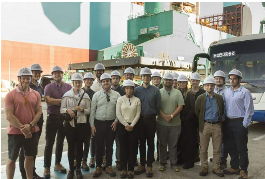
Figure 3: Group picture at HHI in front of the new Maersk methanol vessel

After indulging in a nice breakfast tuesday morning, the group met in the hotel lobby, all wearing safety shoes in anticipation of their tour to the Hyundai Heavy Industries shipyard. The excitement was noticeable as everyone looked forward to their engagement with the Korean maritime industry. Following an hour and a half on the bus, the HHI team greeted the group warmly. The tour began with a carefully well-organized exploration of the inspiring history of Hyundai and its visionary founder, Chung Ju-Yung, from Asan. The narrative of Chung Ju-Yung, once the eldest son of a humble farmer, who ultimately rose to become Korea's most successful entrepreneur by establishing the HHI shipyard, set a captivating tone for the day.