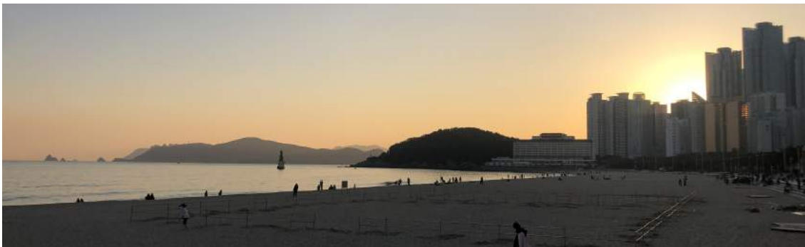
Figure 4: Sunset view from Haeundae Beach

Next and last stop of the day was the beautiful beach of Haeundae, where the local market provided plenty of different traditional lunch options such as cow blood soup, live octopus, and boiled pigs feet. After lunch, the group slowly gathered at the beach where the locals speechlessly watched and filmed us as we stripped down and went for a swim. For dinner, the we all ate Korean barbecue with the mandatory fermented side dishes, accompanied by personal preference of meat, freshly barbecued on the table by the staff. The last scheduled activity of the day was testing of the subway system, which was a complete delight as it was simple, fast and economy friendly.